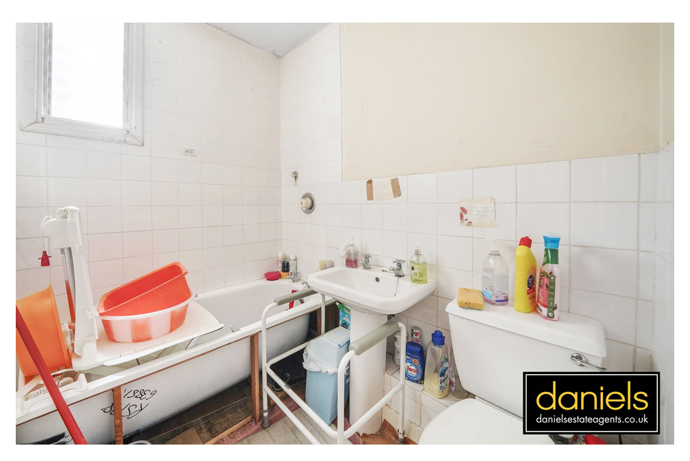
Leghorn Road, London NW10 4PH £795,000 - Freehold