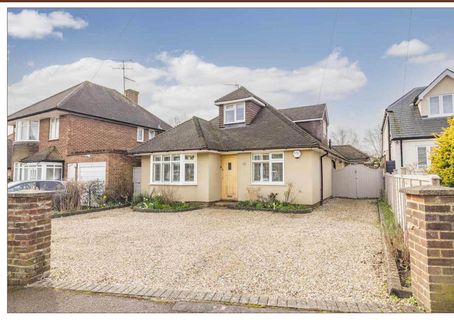
A beautifully presented 5 double bedroom detached family home offering flexible accommodation and located in a highly sought after location within a short drive of Maidenhead Town Centre and railway station.

The spacious accommodation includes: a hallway with stairs to the first floor and two built-in storage cupboards, a bright and spacious living room with feature fireplace and French doors opening to the rear garden, a light and airy dining room with vaulted ceiling and bi-fold doors also opening onto the rear terrace and garden, a modern and well equipped kitchen/breakfast area with integrated Bosch appliances, a utility room with side door access, a family bathroom and three double bedrooms, with two currently being used as a second sitting room and a study.