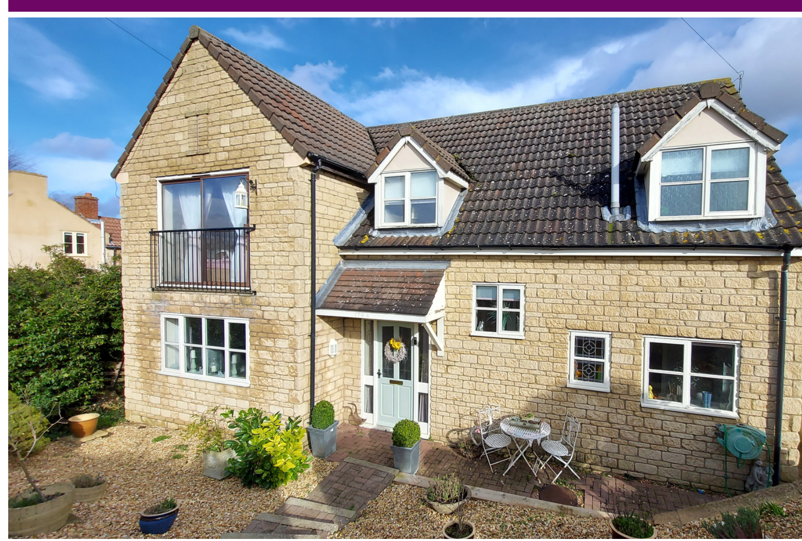
179a Eastgate, DEEPING ST JAMES PE6 8RB