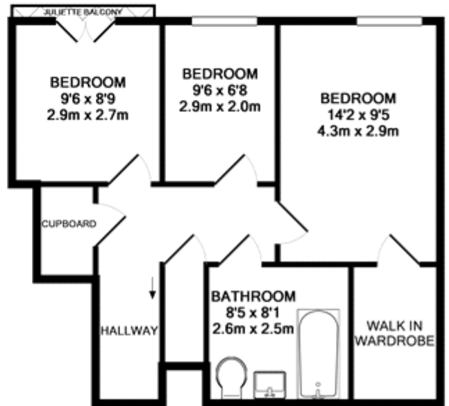
1ST FLOOR APPROX. FLOOR AREA 504 SQ.FT. (46.8 SQ.M.)

TOTAL APPROX. FLOOR AREA 947 SQ.FT. (88.0 SQ.M.)