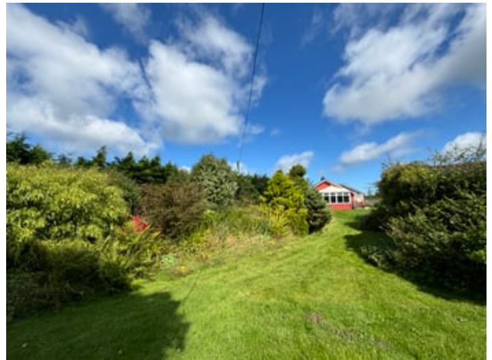
GARDEN (SECOND IMAGE)

The property itself is surrounded by its own garden area being private and well sheltered with an abundance of herbaceous plants, shrubbery and trees.