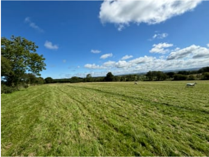
THE LAND (FOURTH IMAGE)