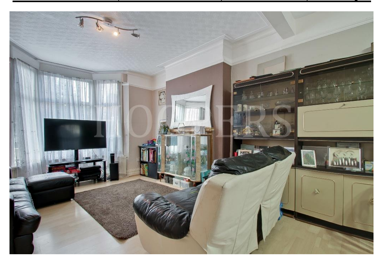
EPC Rating: E

A rare opportunity to purchase a semi-detached house built circa 1900 and situated just off Willesden High Road. Benefits include:-