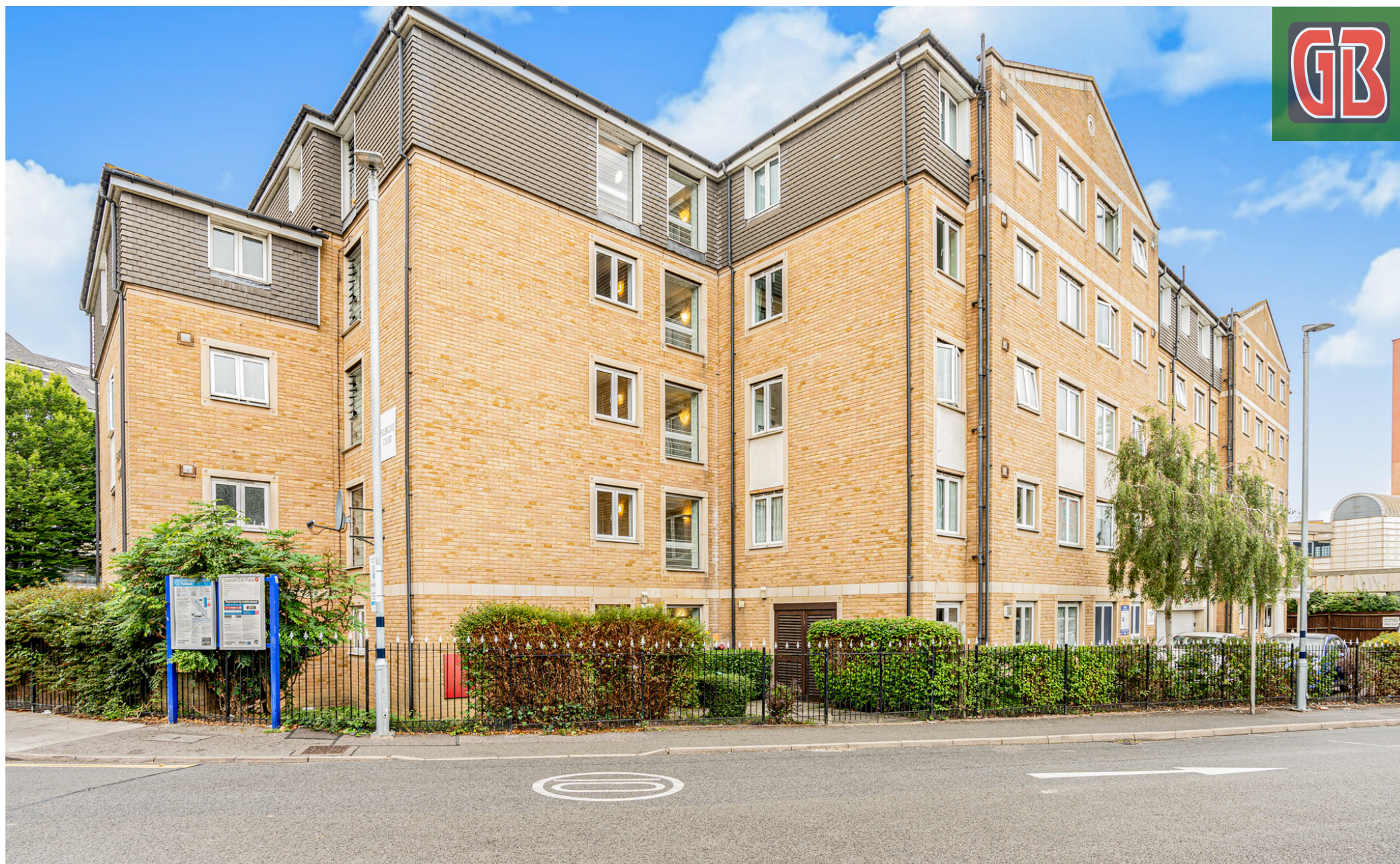
Flat 35 Felbridge Court, High Street, Feltham, Greater London. TW13 4BZ. 1 Bedroom Retirement Property - £110,000 Leasehold