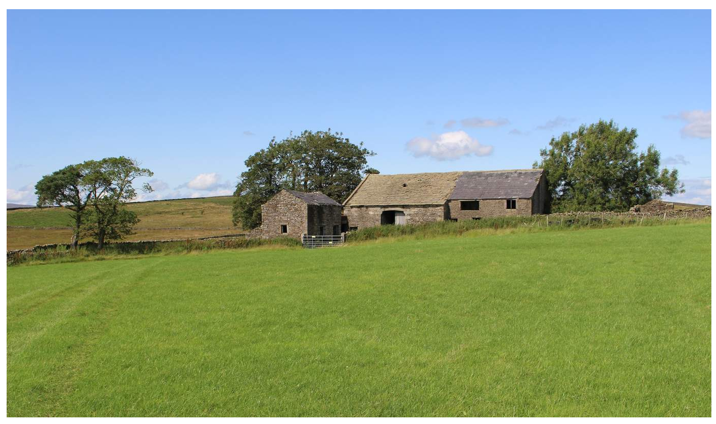
Bolton by Bowland - 3 Miles