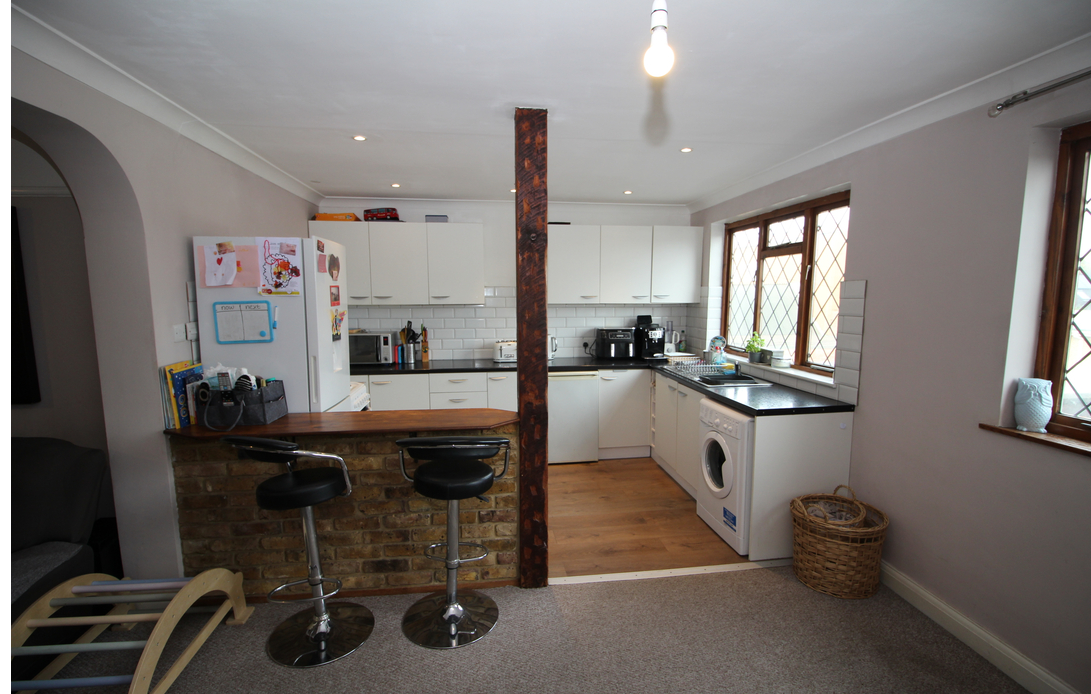
367a Staines Road West, Ashford, Surrey TW15 1RP £244,950 - Leasehold