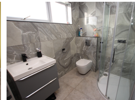
149 Church Street, Langford, Bedfordshire, SG18 9NX