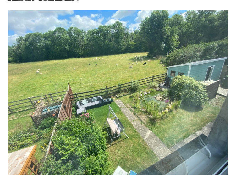
REAR GARDEN (SECOND IMAGE)