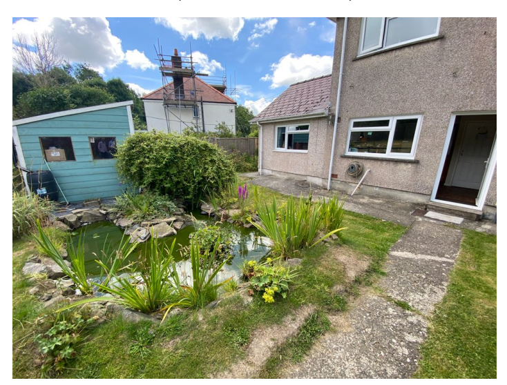
REAR GARDEN (THIRD IMAGE)