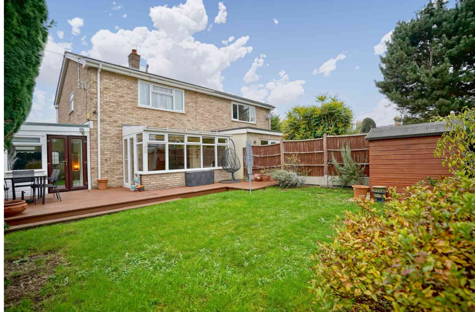
Chestnut Close, Brampton PE28 4TP