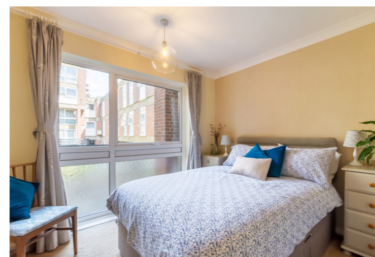
FIRST FLOOR 770 sq.ft. (71.5 sq.m.) approx.