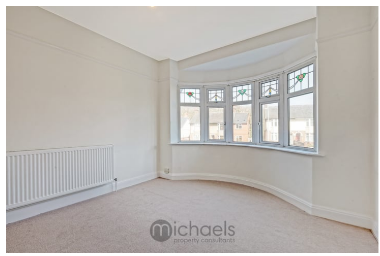
10' 11" x 10' 2" (3.33m x 3.10m)