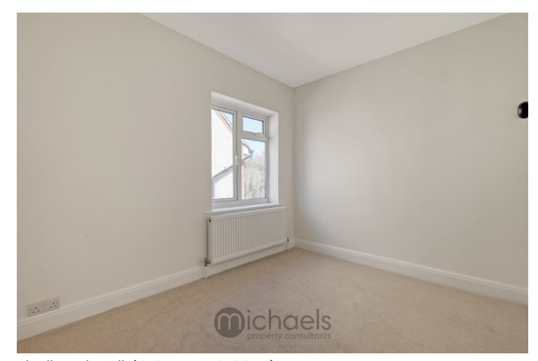
7' 4" x 7' 10" (2.24m x 2.39m)