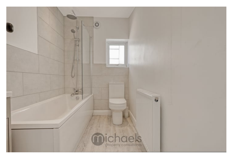
4' 11" x 7' 10" (1.50m x 2.39m)