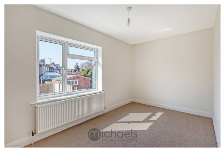
10' 6" x 13' 5" (3.20m x 4.09m)