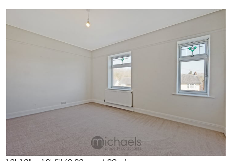
10' 10" x 13' 5" (3.30m x 4.09m)