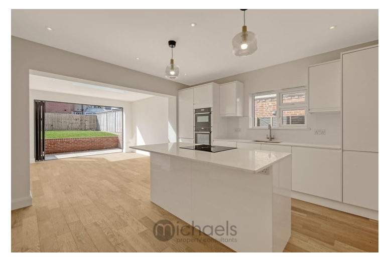
13' 1" x 13' 5" (3.99m x 4.09m) Kitchen 11' 6" x 13' 5" (3.51m x 4.09m) Dining/Family Area