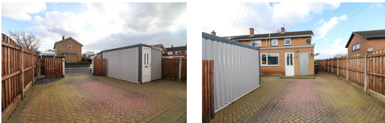
REAR OF THE PROPERTY

OUTSIDE Block paved driveway to the rear of the property providing off-street parking for two/three vehicles, outhouse and pedestrian access gate to the front of the property where there is a low maintenance lawned garden.