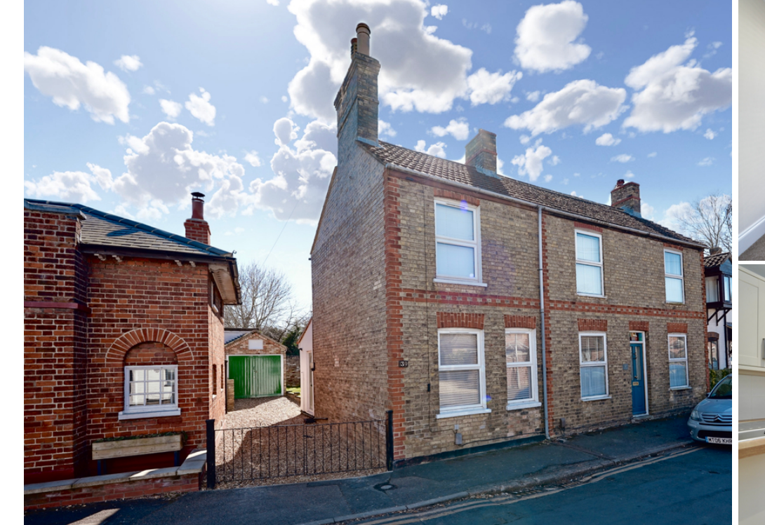
Main Street, Hartford PE29 1XU