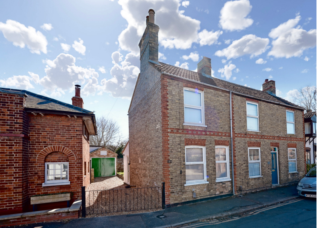
Main Street, Hartford PE29 1XU