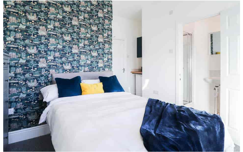
London Road, Northampton NN4 8AH £2,800 pcm