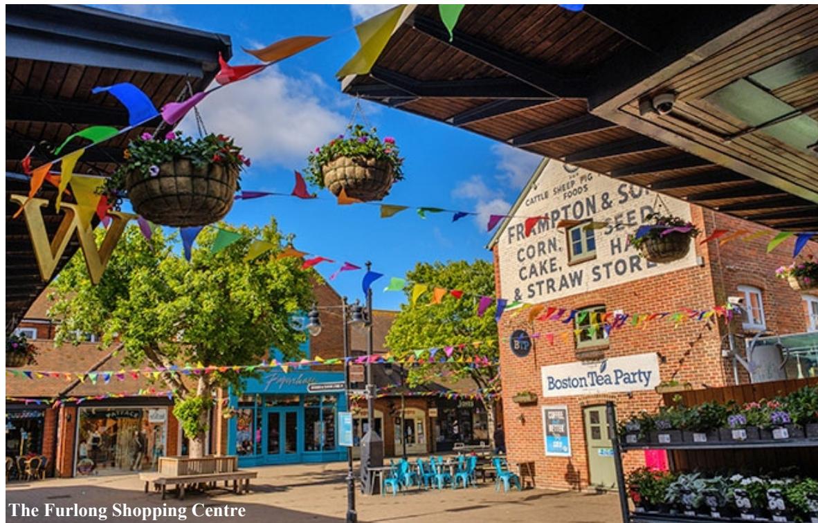
The Furlong Shopping Centre