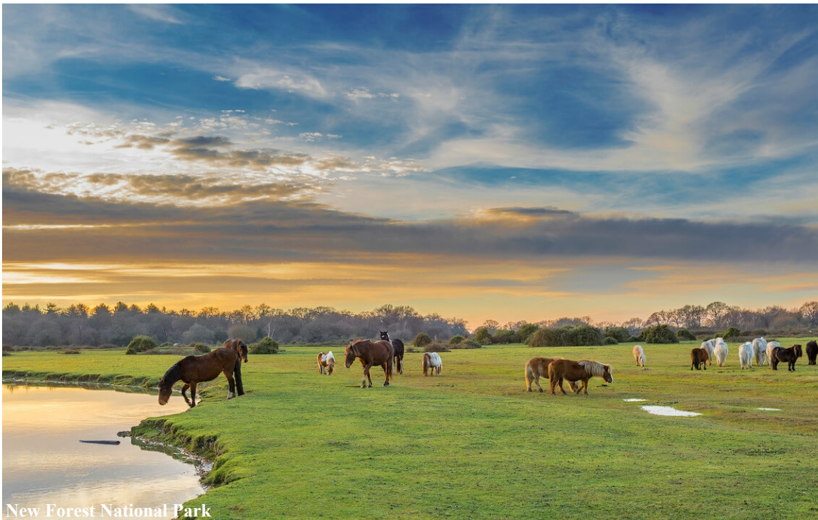
New Forest National Park