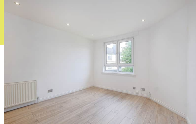
235 Hilton Drive