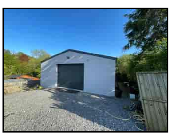
Highbury, Gorrig Road, Llandysul, Ceredigion. SA44 4LQ.