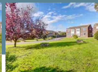
Flat 3 Summer Court, Summerfields Avenue, Hailsham, East Sussex BN27 3AW