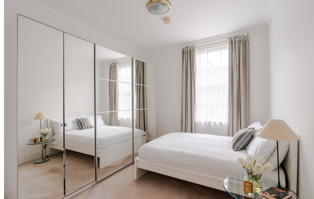
Flat 6, 147 George Street, Marylebone, London, W1H 5LB £700 p/w