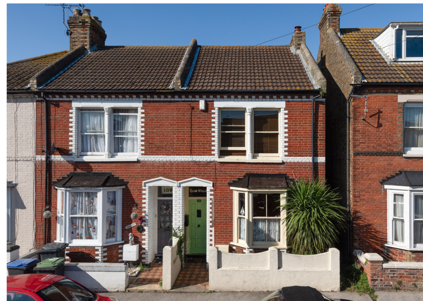
111 Pier Avenue, Herne Bay, Kent, CT6 8TR