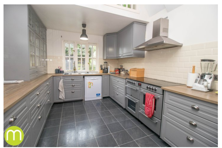
15' 5" x 10' 0" (4.70m x 3.05m) With window to side and rear, a range of matching contemporary base units with square edge worktops over, tiled splashbacks, inset sink and drainer, space for gas range cooker, dishwasher and fridge/freezer, ladder providing access to mezzanine floor. (ideal for storage.)