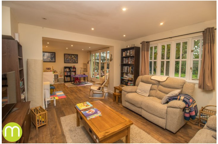
14' 1" x 13' 0" (4.29m x 3.96m) With window to rear, wood effect flooring.