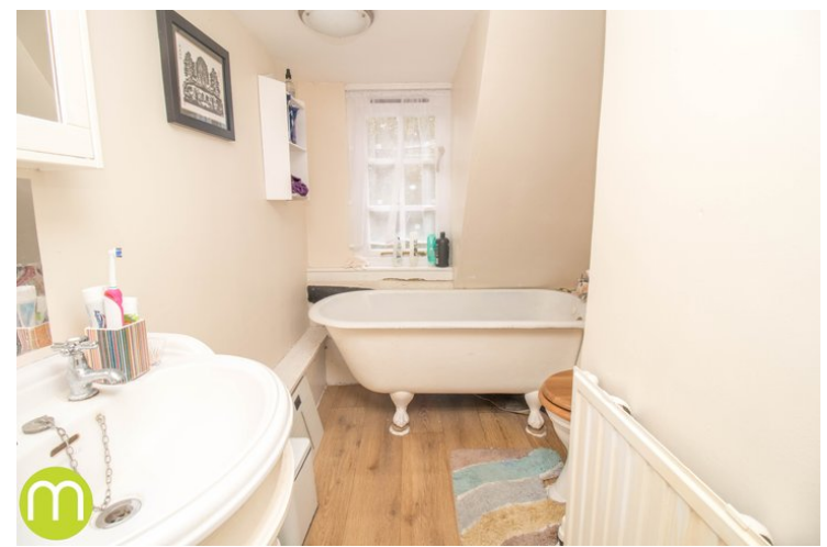
With window to rear, radiator, wash hand basin, low level WC, roll top bath tub.