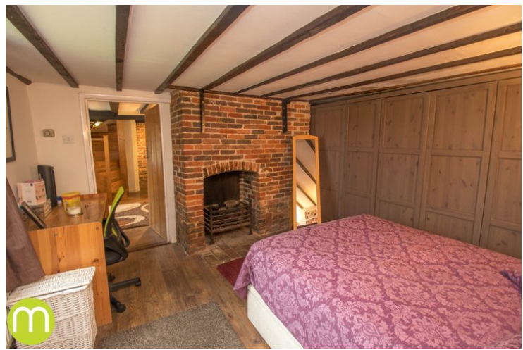
12' 2" x 9' 11" (3.71m x 3.02m) With window to side, radiator, built in wardrobes, fireplace.