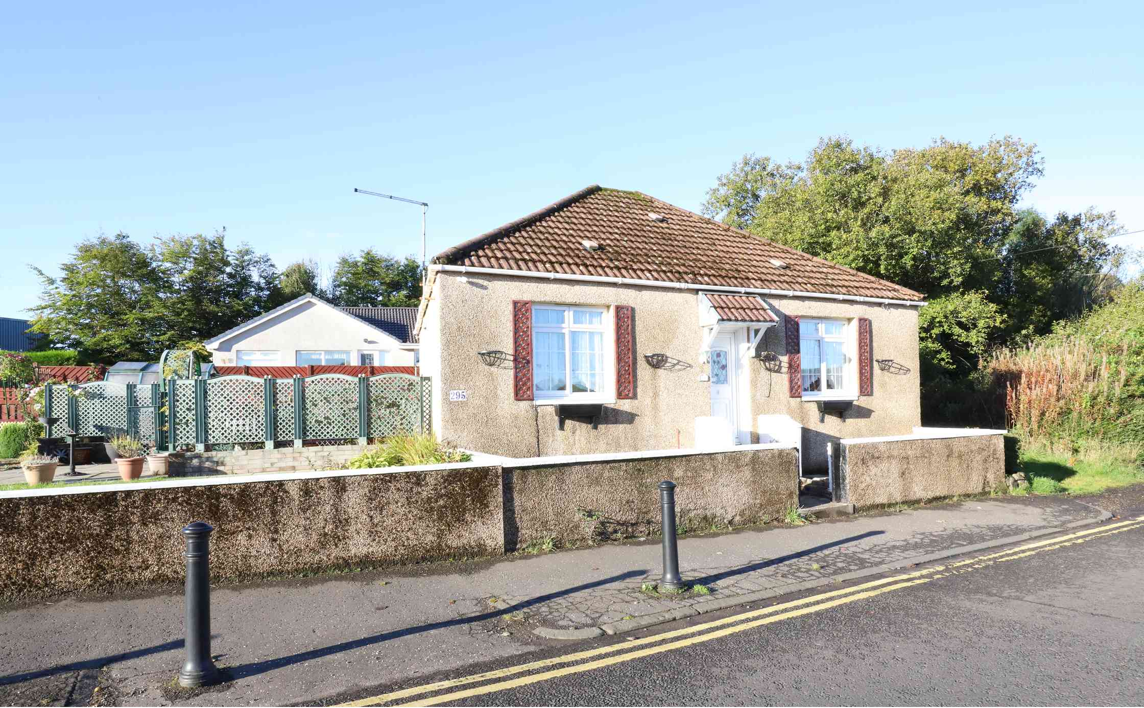
Offers in the Region of £125,000 295 Perth Road, Cowdenbeath, Fife, KY4 9EY