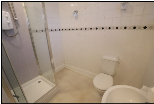
2.2m x 2.2m (7' 3" x 7' 3")