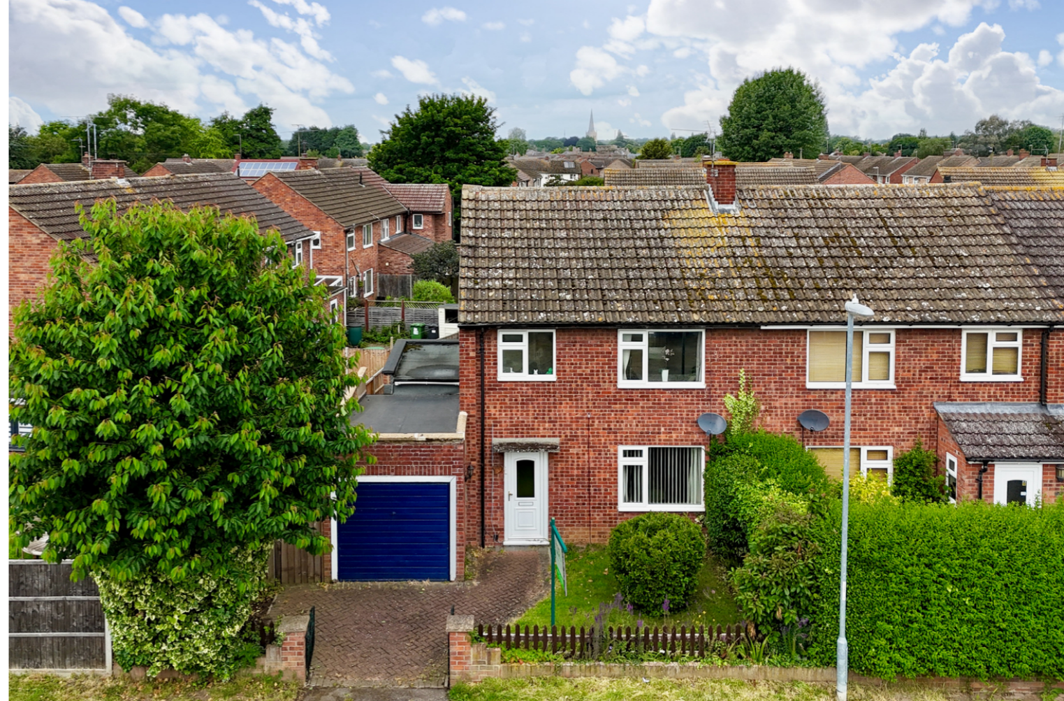
21 Windsor Road, Godmanchester PE29 2DD