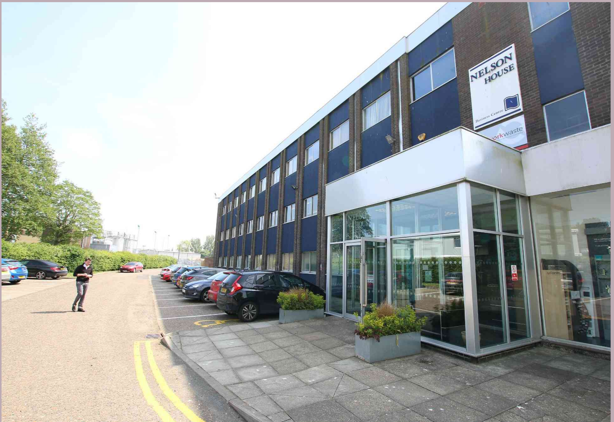
Nelson House (Ground/First Floor Offices) North Lynn Industrial Estate, King's Lynn From £1,500 Per Annum