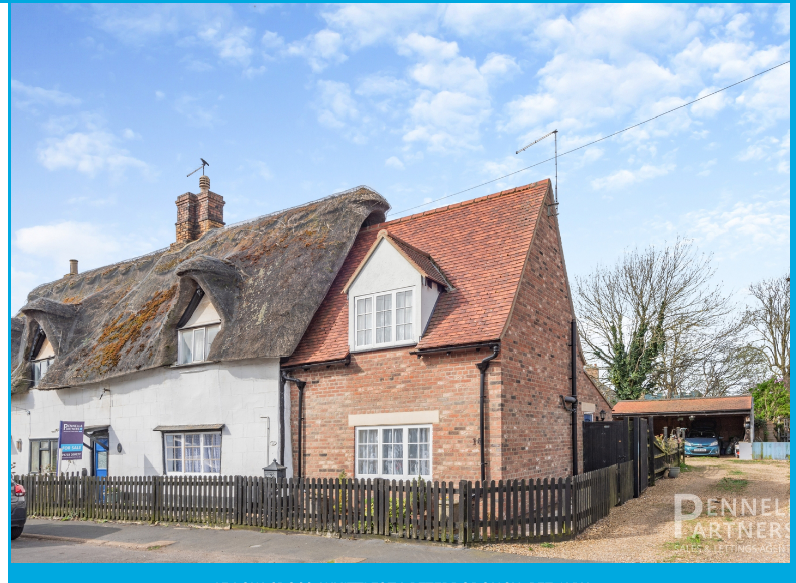
15 LOW CROSS, WHITTLESEY, PETERBOROUGH. PE7 1HW