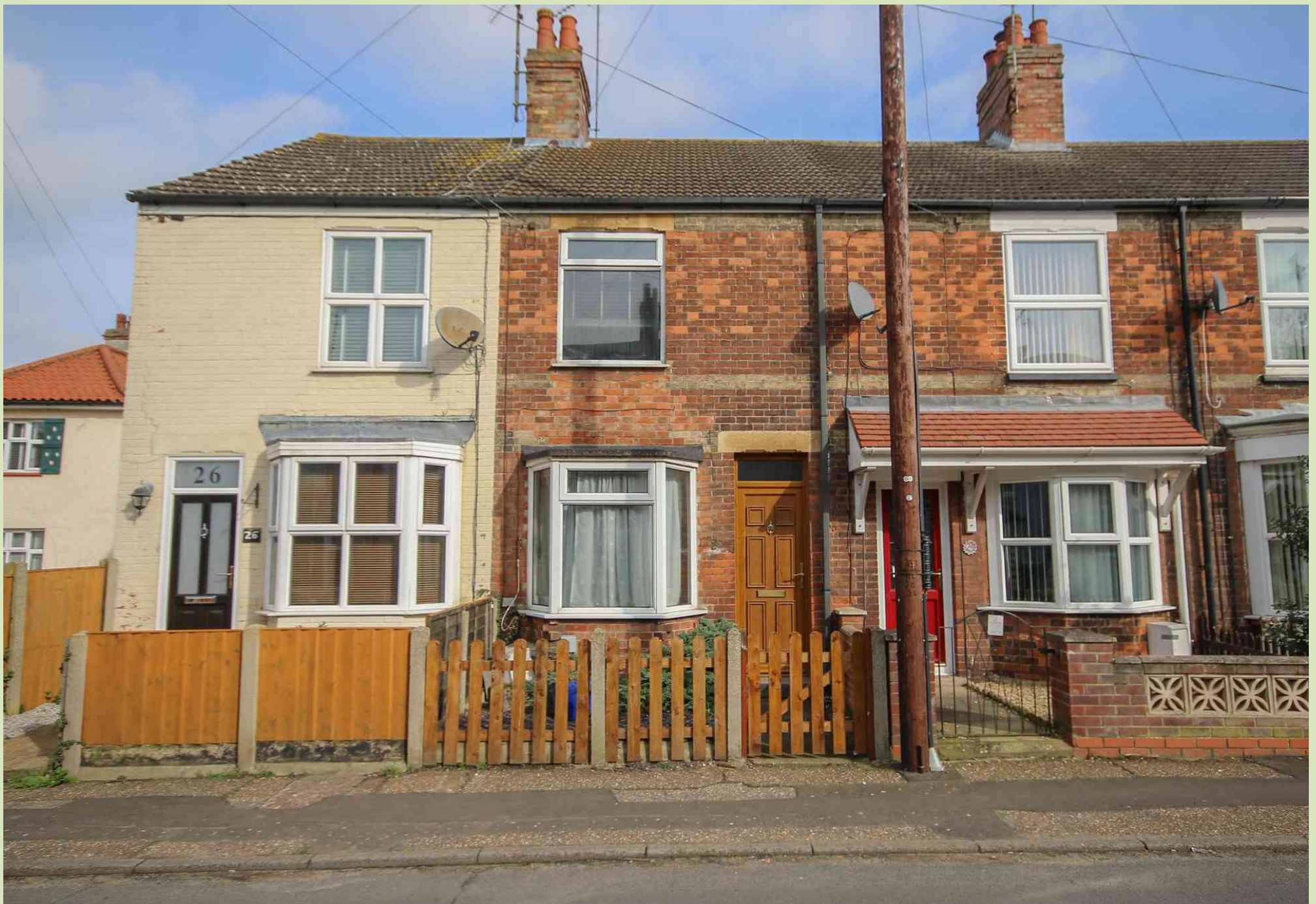
25 Rosebery Avenue, Gaywood Guide Price £170,000