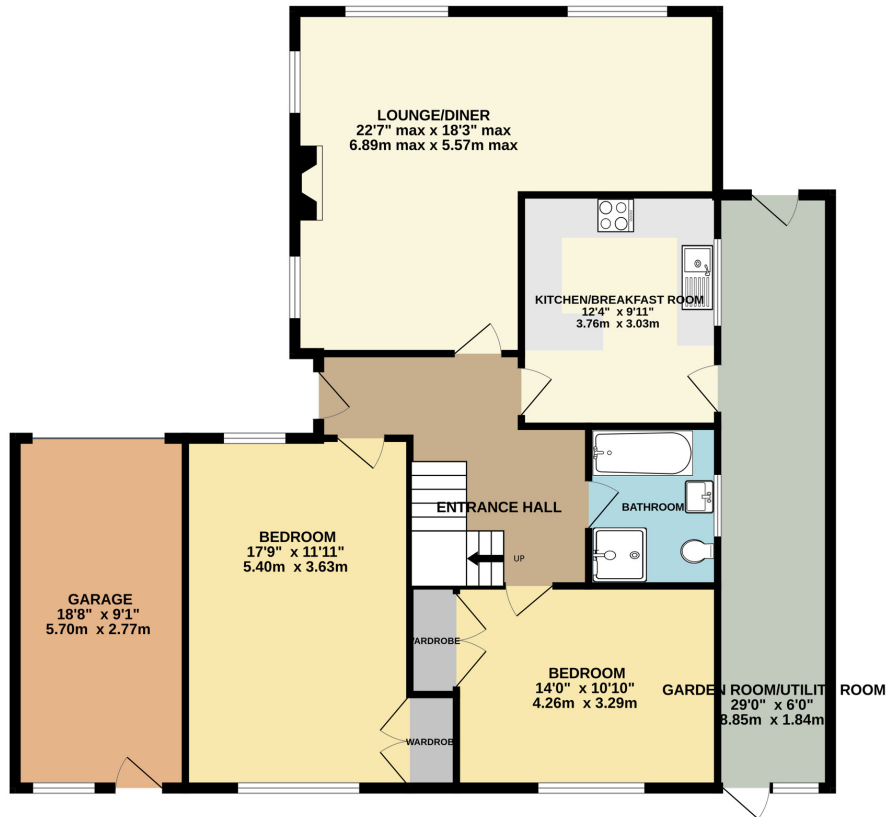
GROUND FLOOR 1397 sq.ft. (129.8 sq.m.) approx.