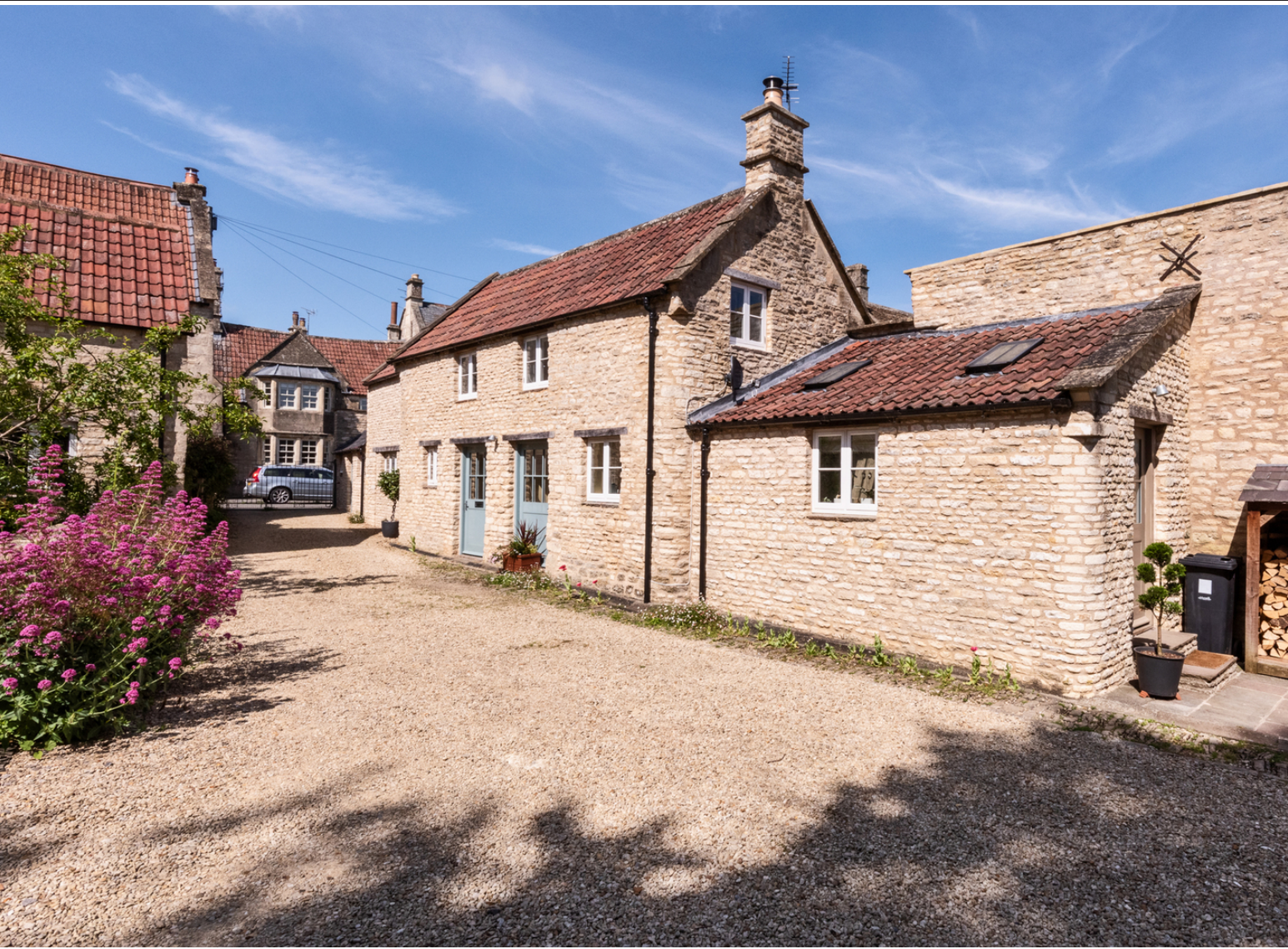
Marshfield, Nr Bath