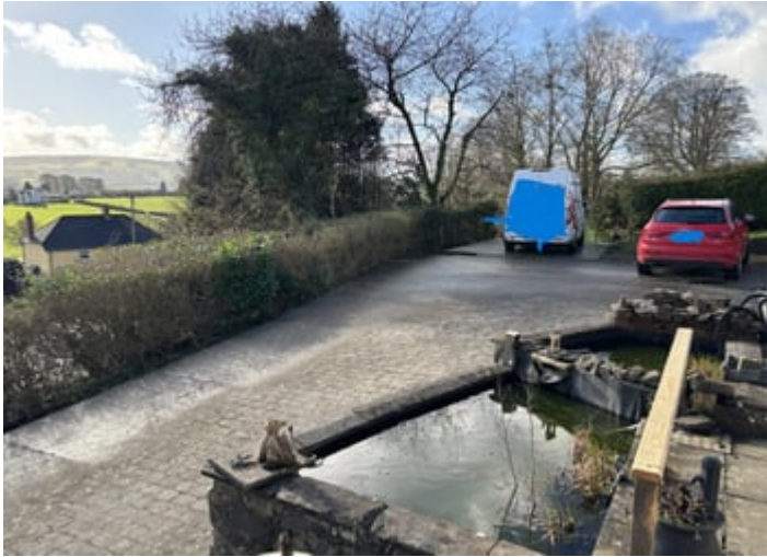
PLOT FOR HOME OFFICE/SUMMER HOUSE