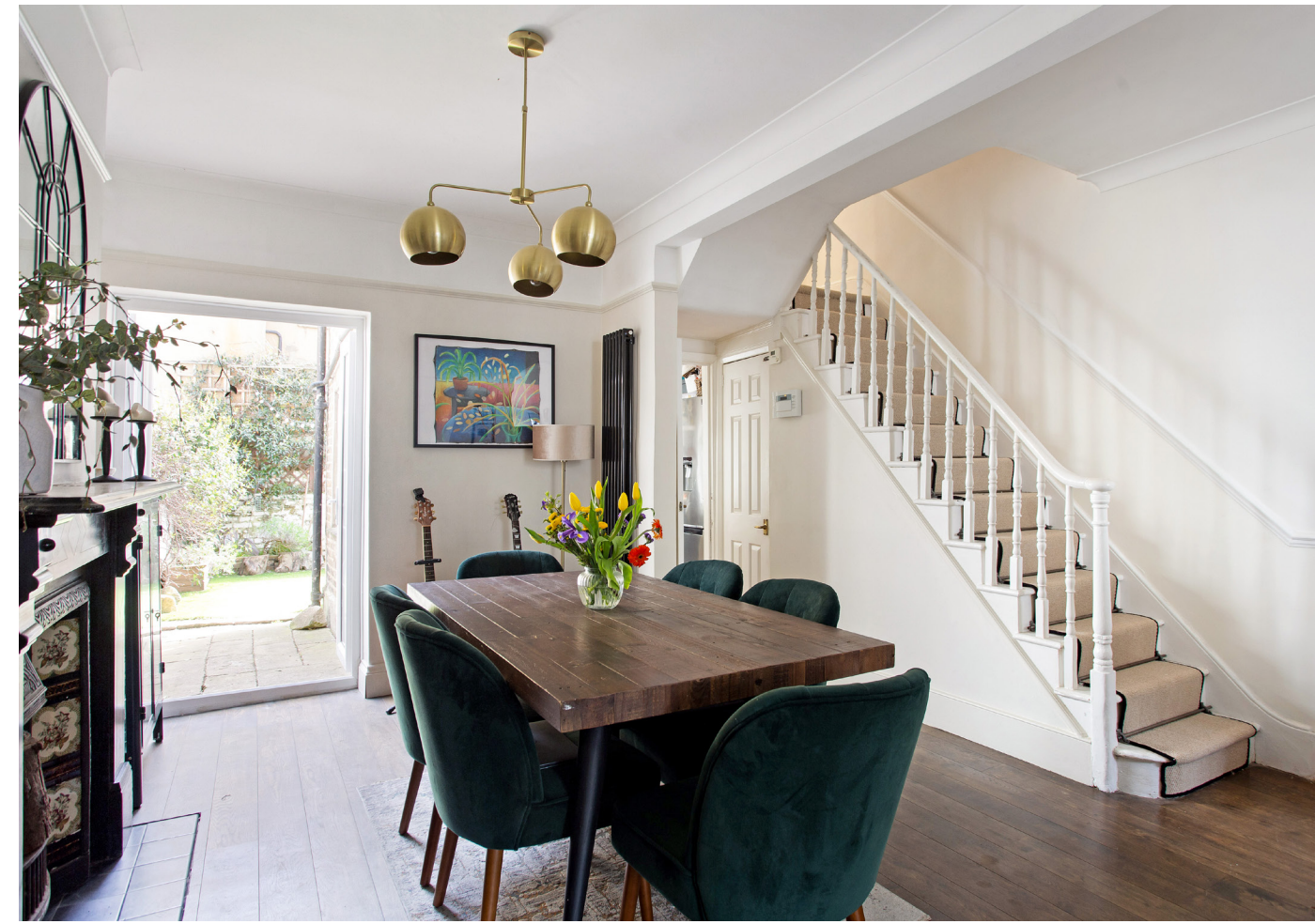
2 BEDROOM HOUSE