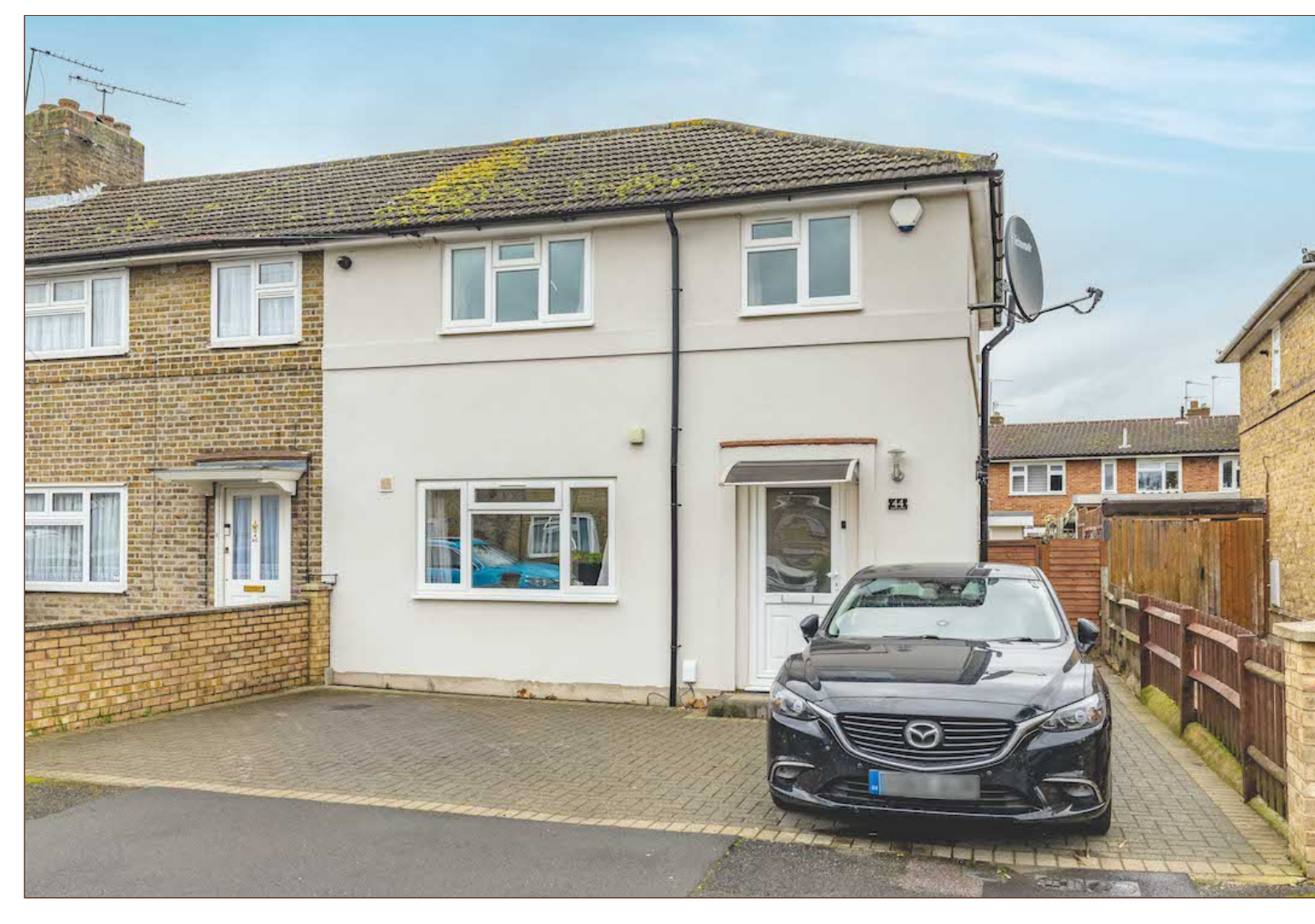
Fusing cutting-edge design with clean lines and state-of-the-art appointments this extended three bedroom semi detached property leaves no stone unturned with a complete renovation from top to toe, in this quite residential area close to local schools.

Boasting an open plan area downstairs combining the dining, living and high gloss contemporary kitchen with white granite work surfaces, two skylights, air conditioning. There is also a further downstairs reception room currently being used as a downstairs bedroom and contemporary three-piece shower room.