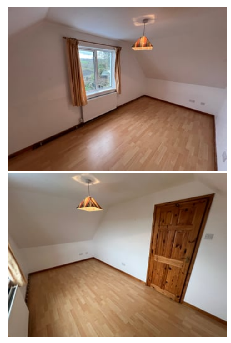
Double Bedroom 3

8' 3" x 17' 1" (2.51m x 5.21m) with double glazed window to rear with glorious views over Aberporth and to the sea towards Ynys Lochtyn, central heating radiator.