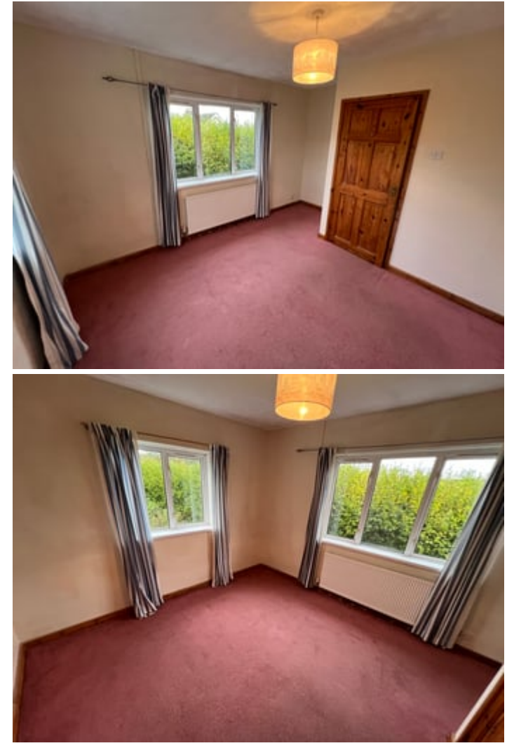
11' 0" x 13' 3" (3.35m x 4.04m) with dual aspect window to front and side, central heating radiator.