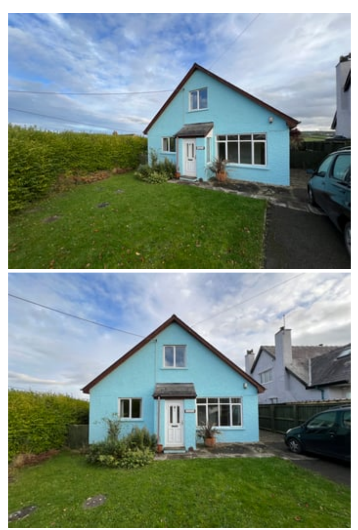
A tarmac driveway with private parking for 2 cars. Front lawned area with hedgerow to boundary.