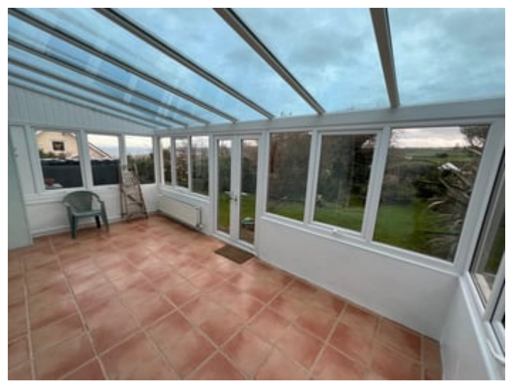
18' 3" x 9' 2" (5.56m x 2.79m) with dwarf walls with double glazed upvc units, glazed glass roof, tiled flooring, central heating radiator, glazed double doors out to rear garden.