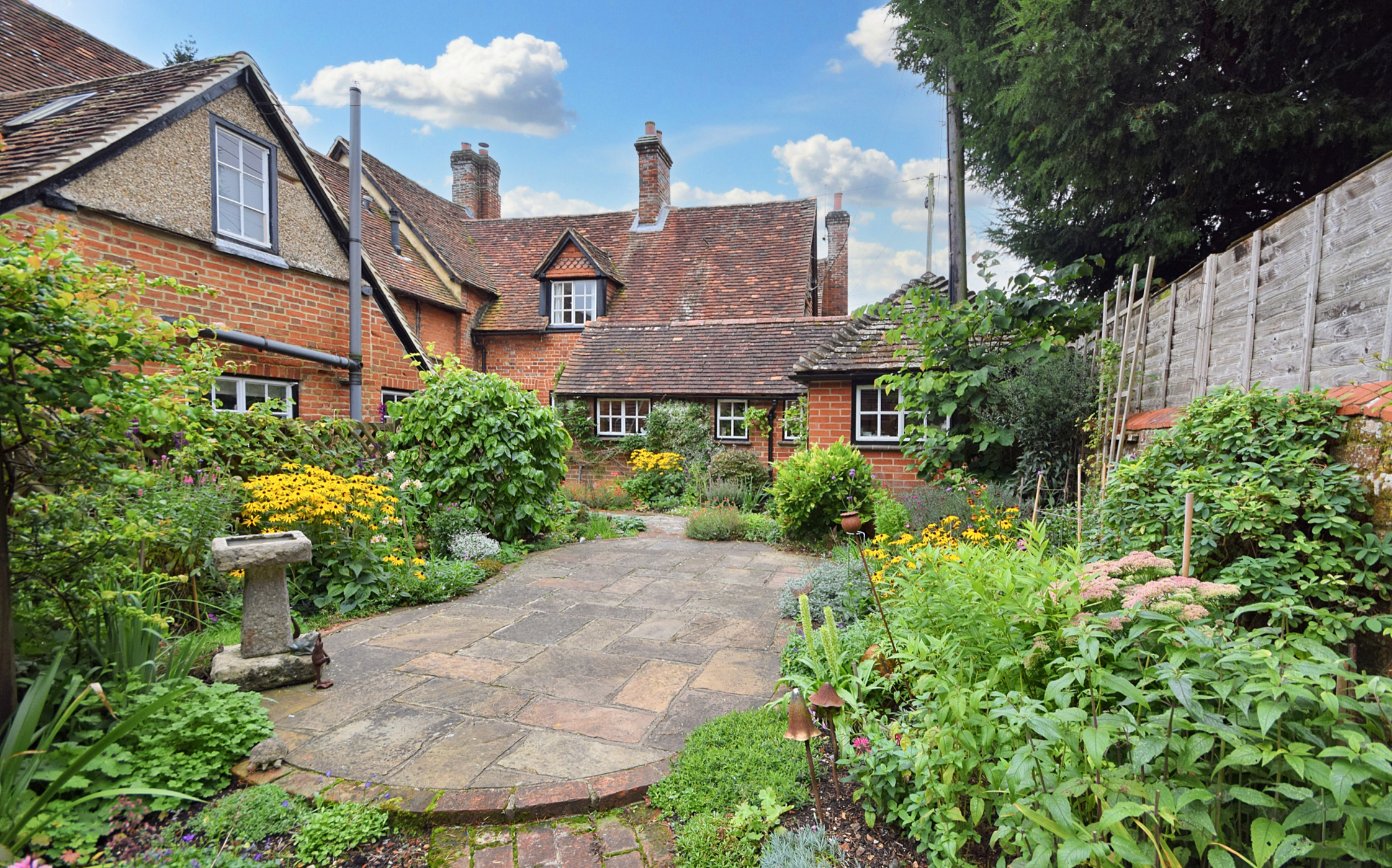
4 Byrons Cottages, Dippenhall Street, Crondall, Farnham, Hampshire. GU10 5PE. Guide Price £675,000