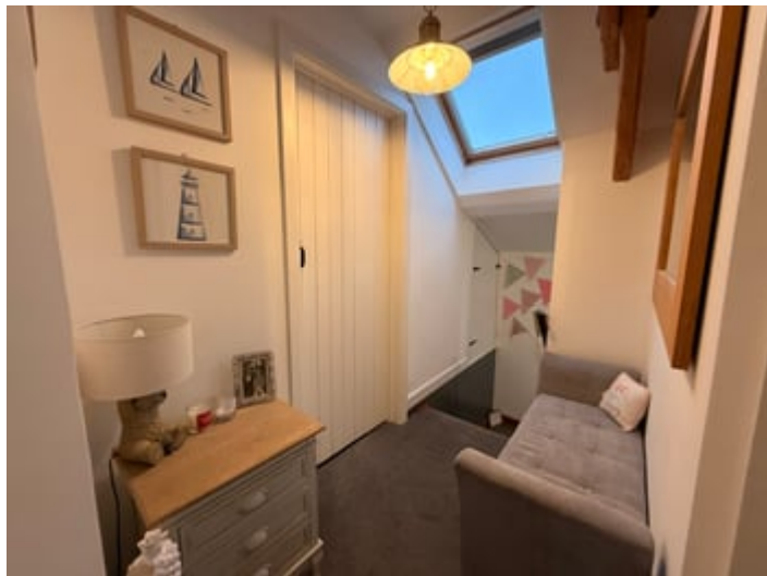
Velux window, exposed beams.