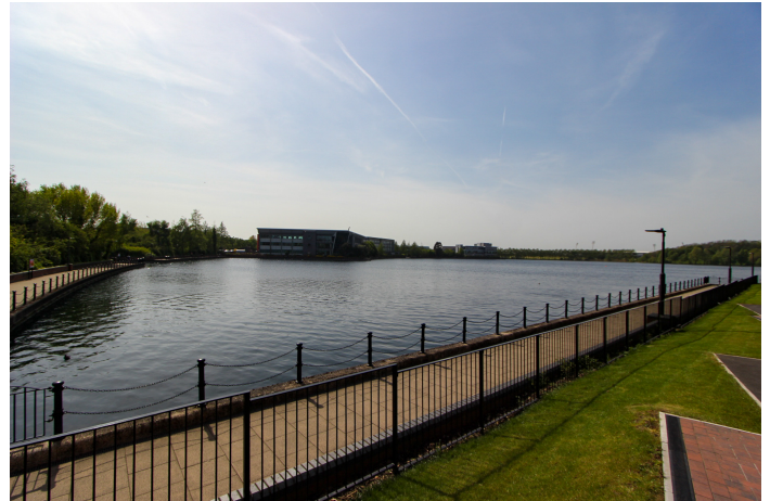
Property Information Form