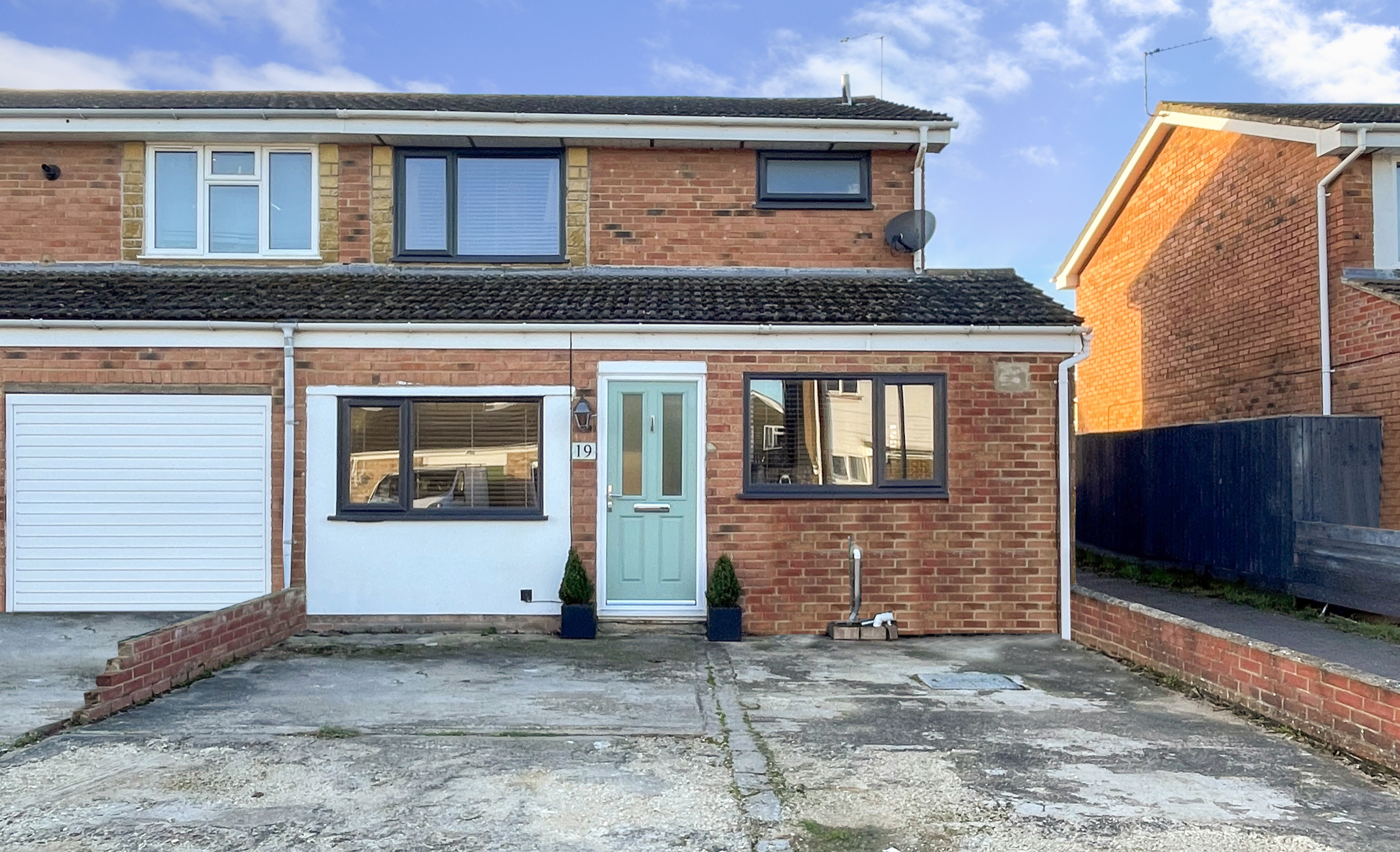
19 Woodhill Drive, Grove, Wantage OX12 0DE Oxfordshire, Guide Price £300,000