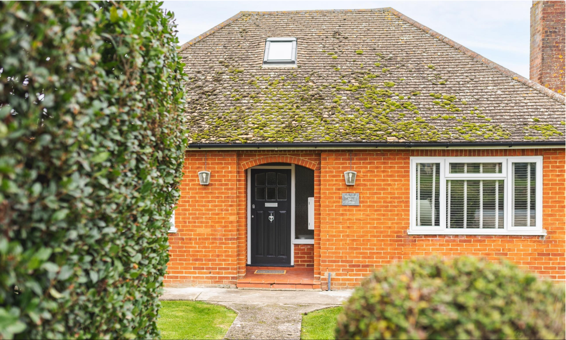
Sunnymead Bungalow Ashwell, Baldock | SG7 5RN