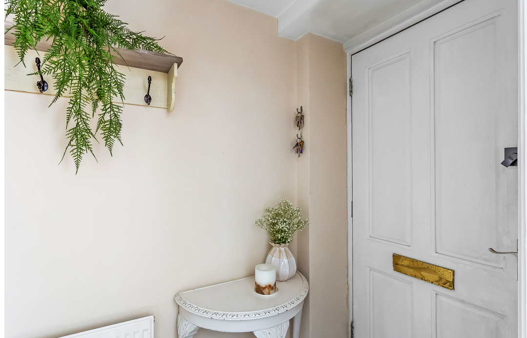
Garden Flat, 5 Mount Sion, Tunbridge Wells, Kent TN1 1TZ £275,000 -