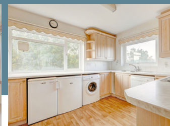
Flat 69 Linkwood, Compton Place Road, Eastbourne, East Sussex BN21 1EF