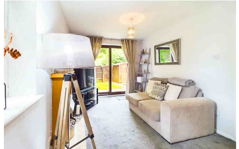
166 Woodpecker Way, Northampton NN4 0QP Guide Price £100,000 - Leasehold