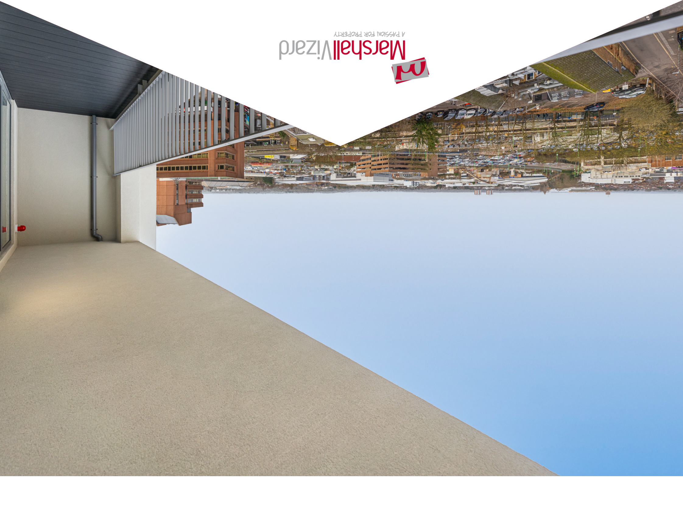
Flat 24 Junction Court, Station Road, Watford WD17 1AP