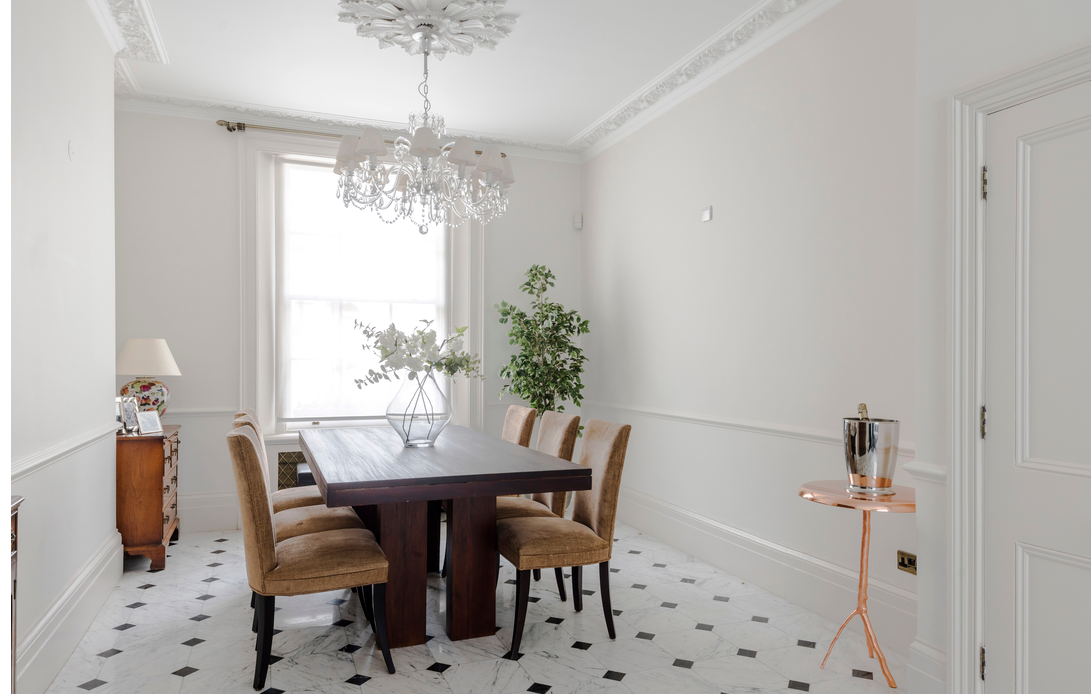
38 South Eaton Place, Belgravia, London, SW1W 9JJ £3,950 p/w