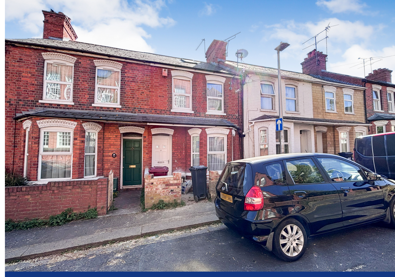
Wilson Road, Reading, Berkshire. RG30.