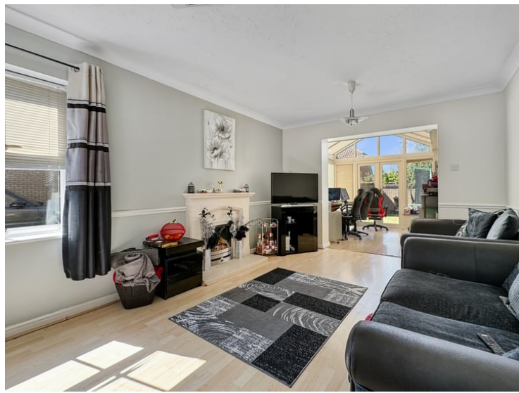
16'\ 3"\ x\ 10'\ 10" (4.95m x 3.30m) Windows to front and side, wood effect floor, stone fireplace with stone hearth, TV point and open to conservatory.