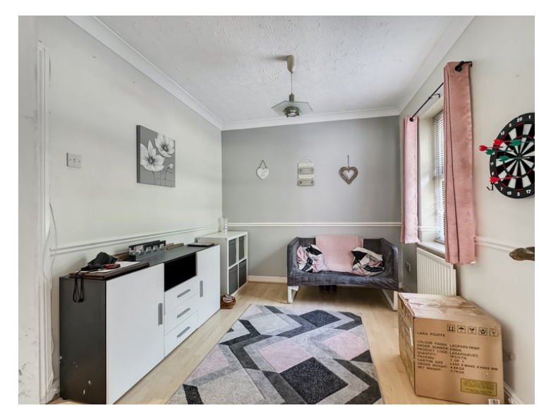
12'\ 0"\ x\ 8'\ 8"\ (3.66m\ x\ 2.64m) Window to front, dado rail, door to kitchen.