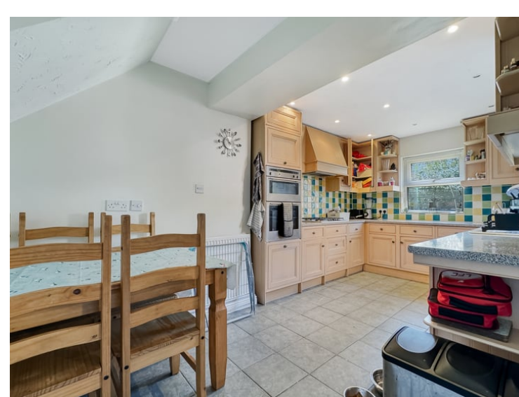
An L Shaped Room Of 19' 9" x 15' 0" (6.02m x 4.57m) Windows to rear and side, door to garden from utility space, tiled floor, a range of fitted units and drawers with worktops over, inset sink and drainer, fitted oven, gas hob and extractor, tiled splashbacks, matching eye level units.