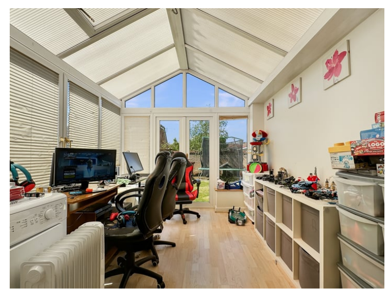
10' 6" x 9' 6" (3.20m x 2.90m) Brick plinth and Upvc construction, French doors to garden, wood effect flooring.