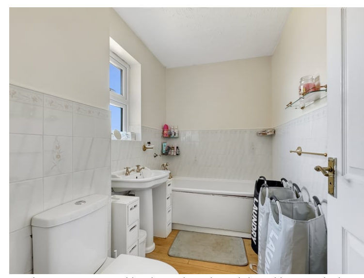
Window to rear, panel bath, pedestal wash hand basin, tiled splashbacks.