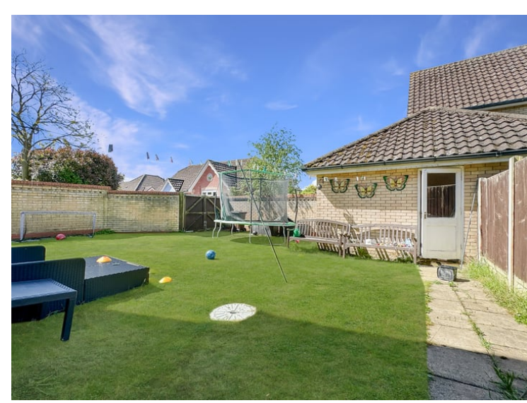
Small front garden retained by dwarf hedging. The rear garden is predominantly laid to lawn with patio area, enclosed by fencing and walling. Twin gates to rear offering vehicle access.