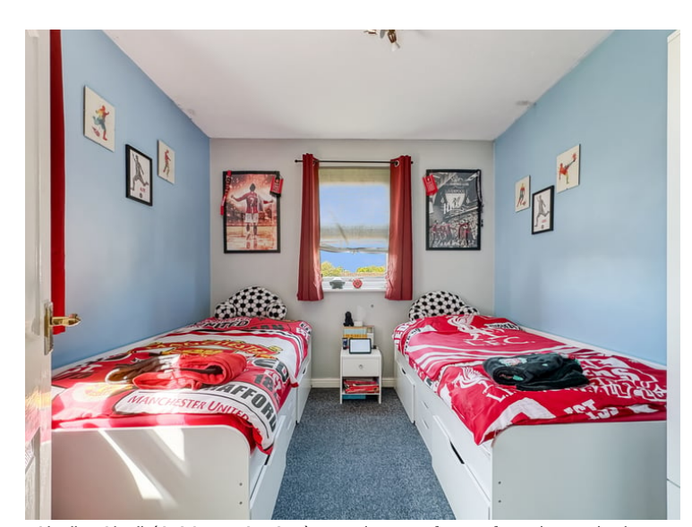
10' 6" \times 8' 7" (3.20m \times 2.62m) Window to front, fitted wardrobe.