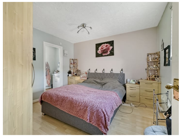
11' 9" x 11' 0" (3.58m x 3.35m) Window to rear, fitted wardrobes and doors to en-suite.