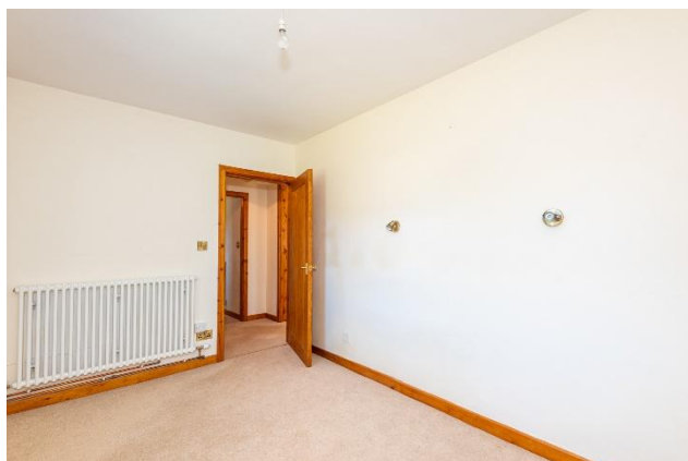
ANNEXE BEDROOM 1

ANNEXE BEDROOM 2 (12' x 8') Double glazed window to the side and cast radiator.