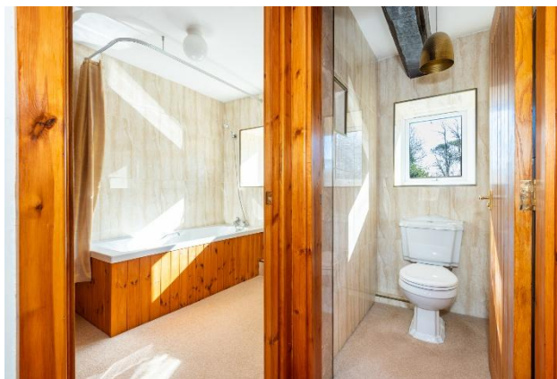
BATHROOM & CLOAKROOM

BEDROOM 5 (18' x 8') Double glazed window to the rear, radiator, beamed ceiling, and doors leading through to an en-suite shower room and the barn.