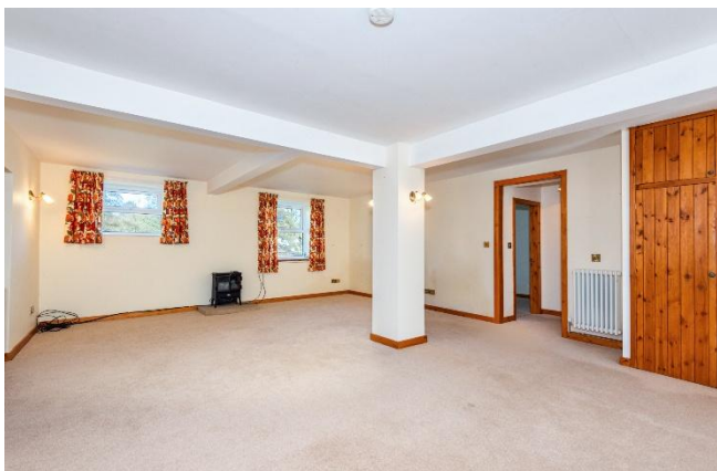
ANNEXE OPEN PLAN LIVING & KITCHEN

REAR HALLWAY Doors leading through to both bedrooms and bathroom.