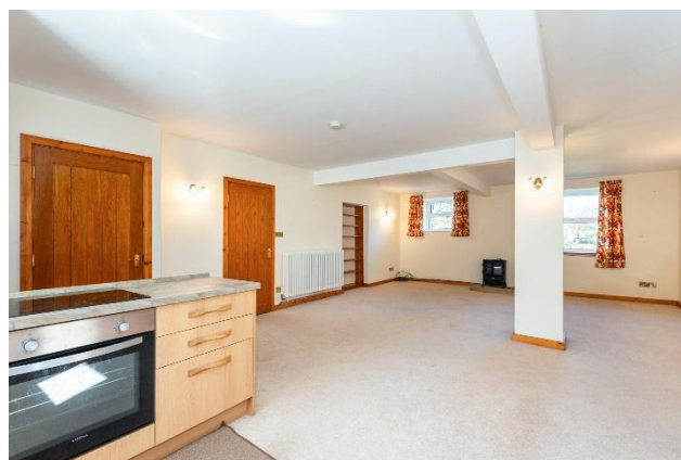
ANNEXE OPEN PLAN LIVING & KITCHEN