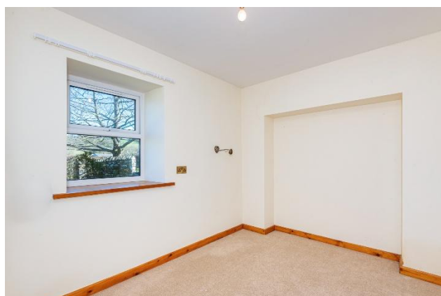
ANNEXE BEDROOM 2