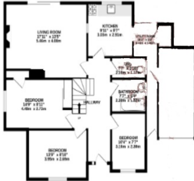
GROUND FLOOR 1063 sq.ft. (98.8 sq.m.) approx.