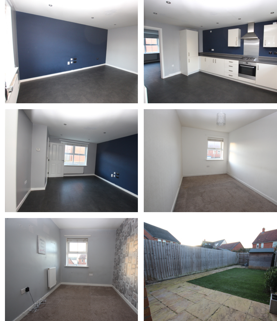
19 Mayflower Lane, Langford, Biggleswade, Bedfordshire, SG18 9FR